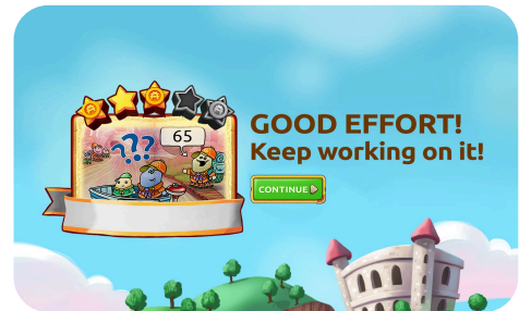
Complete activities to earn stars