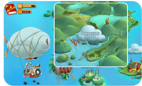
Go to The Adventure Island